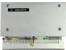
CAN-bus distributor AS