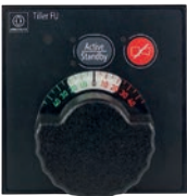
Tiller follow-up AS