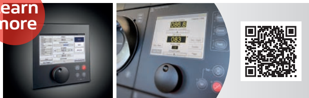
Fuel saving autopilots