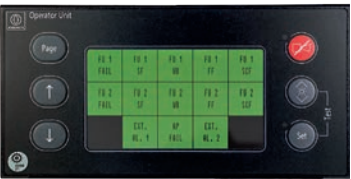
Alarm signal unit AS