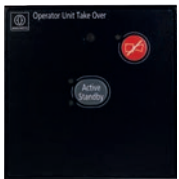
Take over operator unit AS