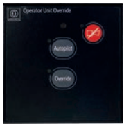
Override signal unit AS