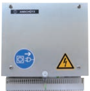
Alarm status interface AS