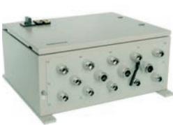
Follow-up amplifier proportional AS