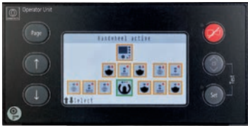
Steering mode operator unit AS