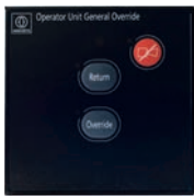
General override signal unit AS