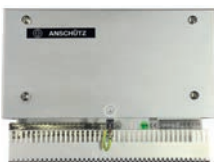
Gateway dual LAN AS