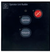
Rudder mode operator unit AS