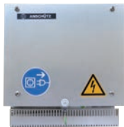
External steering interface AS