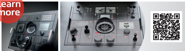
Steering control systems

www.anschuetz.com/products/steering-control-systems