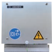
Follow-up amplifier AS