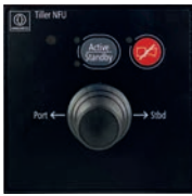
Tiller non follow-up AS