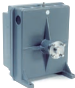
Rudder feedback unit AS