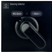
Steering mode selector switch AS