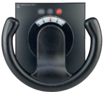
Handwheel follow-up AS