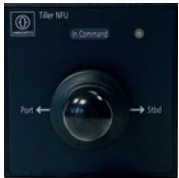
Tiller non follow-up direct